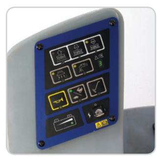
One-Touch ^{\text{\tiny{M}}} activation of scrub system. All systems start and stop with machine motion.