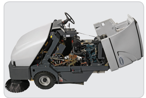
MaxAccess™ allows faster repairs and less downtime so the sweeper spends less time in the shop and more time sweeping