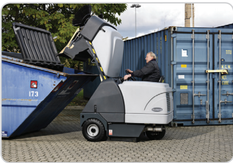
Variable dump height of up to 62 inches allows fast and simple disposal of swept debris