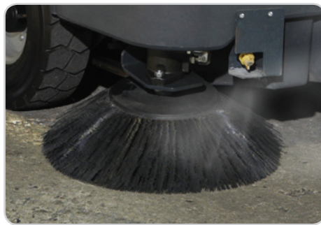
DustGuard™ suppresses airborne fugitive dust where most dust is generated – at the side brooms